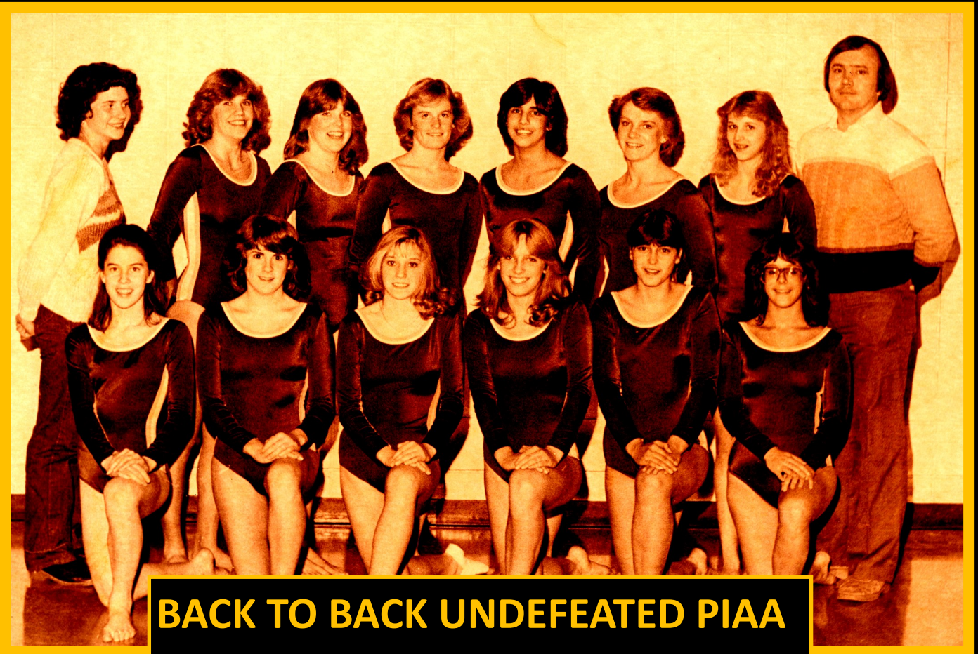
BACK TO BACK UNDEFEATED PIAA STATE CHAMPIONS 1981-1982